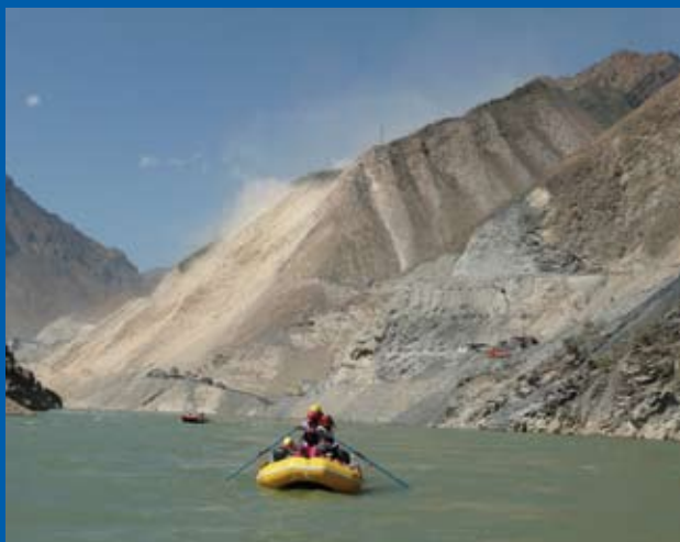
International Rivers staff participated in a rafting trip on the Yangtze organized by China Rivers Project to bring Chinese journalists and citizens to a stretch of the river threatened by new dams. Here the boats pass the Ahai Dam site, a controversial dam that is not yet permitted for construction but is clearly well under way.