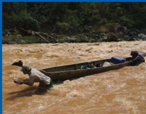
These photos were taken in the same place on Laos' Xe Kaman River four years apart. The photo on the right was taken in 2008, after construction began on the Xe Kaman 3 Dam, which will export power to Vietnam. One of the dam's more visible impacts is heavy siltation, which has made the river a muddy mess.