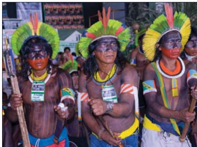
Tribal leaders at the gathering.