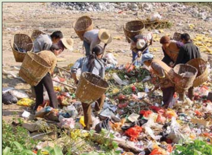
Manwan dam migrants scavenge at a garbage dumpsite for survival.

Following his assessment, China Green Watershed led a study tour of the Manwan Dam site for residents of the neighboring Nu River valley, an area also slated for large hydropower develop-