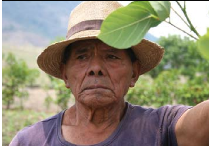
A farmer at a Chixoy resettlement community. The population there has grown considerably since it was first settled some 20 years ago but they have the same amount of land, and too little water.

Related to this, try to avoid assigning blame before reaching the means for remediation. You can begin this process with the negotiation of the political governing document, by stating that the objective is to determine what unresolved or remaining damages resulted from some event, such as the building of the dam, rather than what damages resulted from some blameworthy act, such as the government's failure to resettle or failure to keep promises.