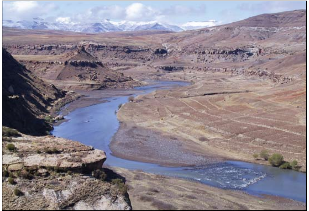
The Senqu River. The gravel bar mid-photo formed since the LHWP dams reduced regular floods. Such changes can block the river channel and cause a number of problems for river functioning over the long term.

When implementation of the policy began in 2003, the focus switched to monitoring downstream rivers and administering compensation payments to local communities. Compensation included