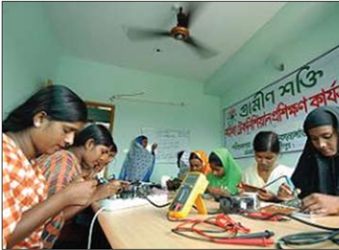
Women at work in a Grameen Shakti technology training center.