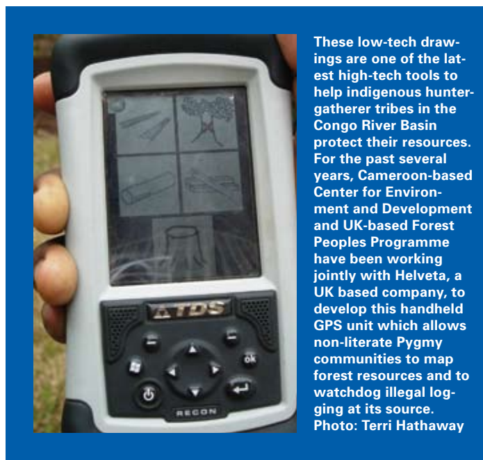
These low-tech drawings are one of the latest high-tech tools to help indigenous hunter-gatherer tribes in the Congo River Basin protect their resources. For the past several years, Cameroon-based Center for Environment and Development and UK-based Forest Peoples Programme have been working jointly with Helveta, a UK based company, to develop this handheld GPS unit which allows non-literate Pygmy communities to map forest resources and to watchdog illegal logging at its source.

From “Banks meet over £40bn plan to harness power of Congo river and double Africa's electricity,” the UK Guardian , April 21, 2008