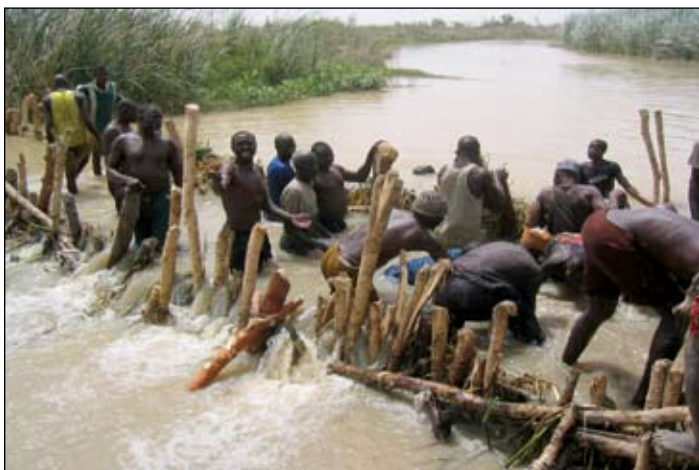
Flooding is a major issue for communities in the HJKY basin.

Fisheries have been harmed by dam-related changes to flooding. The impacts have been felt by fishermen, fish processors, fish wholesalers, fish retailers, fish gear dealers and boat builders. All of these changes have increased local poverty levels.