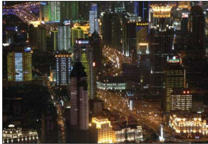
Shanghai at night. China's rapid growth makes improving energy efficiency imperative.