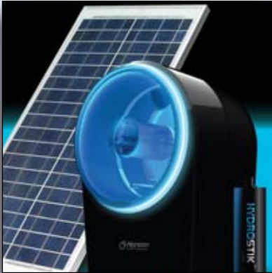
The Hydrofill desktop fuel cell.

Hydrogen accounts for about 90% of the universe's atoms, so it's no wonder that people have been trying to find ways to turn it into fuel for a long time. However, one of the main drawbacks is that it takes more energy to produce hydrogen from water than it creates, so hydrogen is actually better as a form of energy storage than energy creation.