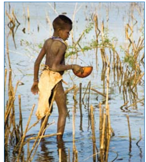
A Karo boy collects water from Omo River floodplain in Ethiopia.

More and more, adults and students are understanding that our water supply is finite and that humans must change their patterns of consumption and waste in order to protect our natural resources – the most vital of which is our finite supply of fresh water. ●