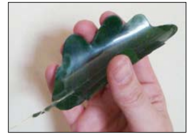
A Solar Botanic nano-leaf

It's going to be awhile before our urban forests become power plants, though: a prototype probably won't be ready until 2012. ●