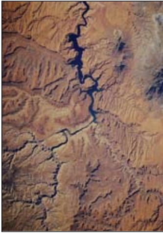
The Colorado River.

Aaron Million proposes building a 400-mile-long pipeline from the Green River, a Colorado River tributary, which would divert up to 250,000 acre-feet of water each year to outlying Colorado suburbs.