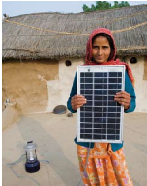
While India's national solar plans gain steam, many communities are taking the lead by building village-scale projects. The village of Legga in Rajasthan was solar-electrified by women trained as Barefoot Solar Engineers.

Several international studies have pointed to the potential benefits of solar energy for India, including lower long-term energy costs, greater energy security, rapid scalability, and job creation, in addition to multiple environmental benefits. But the studies observed that India had not yet demonstrated the political com-