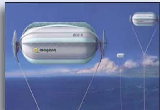
Wind power takes to the skies.

Typical wind turbines today operate at about 100 meters above the ground; the wind kites fly on average at 400 meters.