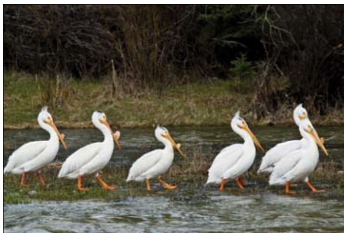
White pelicans on the Mississippi.