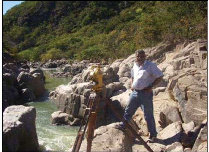
A community surveyor on the Mocal.

Privately developed medium-sized and small dams in Honduras receive tax breaks, and private electricity producers benefit from fiscal incentives, tax exemptions and the recognition of 10% of the short-term marginal cost per kilowatt-hour as a premium.