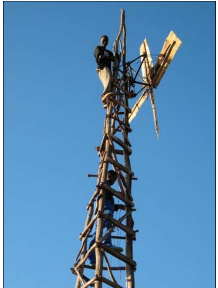
Africa's most famous wind turbine was built out of bicycle parts, scrap wood and assorted junk by William Kamkwamba, at his family's homestead in rural Malawi. The story of the self-taught renewable energy engineer got international attention, and resulted in a book. Learn more: williamkamkwamba.typepad.com

The biggest barrier to scaling up microhydro (and other renewables) in Kenya was governmental policy that prohibited independent power producers, even off-grid ones. This government monopoly on power supply meant that the Kathama and Thima microhydro projects required special permission from the government. By directly involving the Kenyan Ministry of Energy from the start, the project was able to influence national policy, and the new national energy policy will not require special permission from microhydro projects in future.