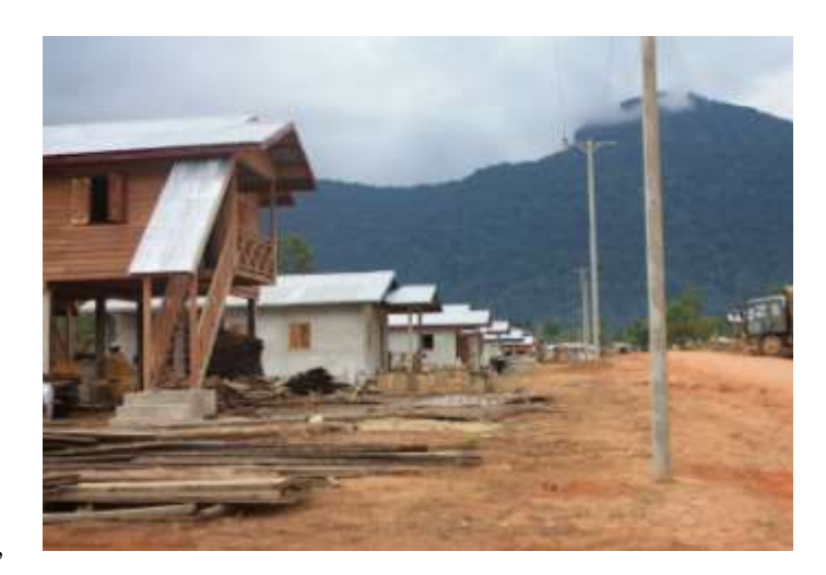
Figure 8: Resettlement site in Nongxong Village

In the CA and RAP, THPC promised to provide displaced persons 440 kg of milled rice per person per year and an additional support of supplementary protein to meet basic nutritional shortfalls during the transition period until livelihood activities provide subsistence requirements. However, the village headman in Phabang Village