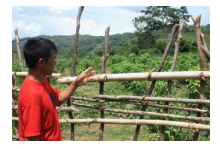
Figure 6: This man from Sopkhom Village is concerned about compensation for his riverbank garden, where he grows chilies and tobacco.

However, villagers in Somboun Village who have lost their entire land holding reported that each family is entitled to only one hectare of farmland in the resettlement area and cash compensation for the remaining lost land. One of our interviewees in Somboun used to have 2-3 ha of land, including 1.8 ha of rice paddy and a vegetable garden. They used to collect bamboo shoots and wild boar from the forest and fish from the river. The village headman in Somboun Village used to have three hectares of rice paddy. His wife reported that "we received only a little bit of money to compensate for our land and the money is not enough to buy new land." 5