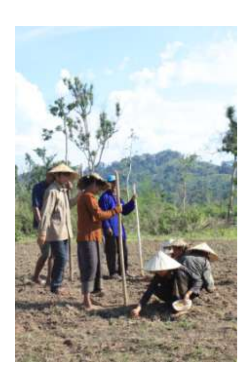
Figure 11: Villagers planting upland rice in the Hinboun Valley. Villagers have had to increase upland rice cultivation due to flooding of rice paddy as a result of the existing project.