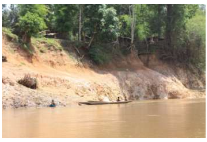
Figure 3: Erosion along the Hinboun River

Research (RMR) – a consulting firm originally contracted to conduct the EIA for the proposed expansion project – estimated that as of 2005, the original Theun-Hinboun project had caused the Hai River channel to widen by about 45m, leading to the loss of around 68ha of land (RMR 2006: 2-24). RMR estimated the value of this land to be between $100,000 and $136,000, but villagers have not received any compensation for these land losses. These impacts have become more and more severe since the project started operating in 1998. During the field visit, the village