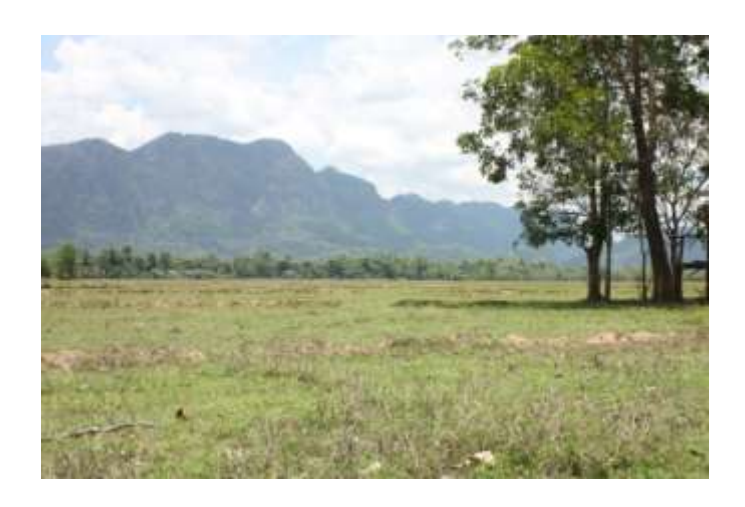
Figure 9: Abandoned paddy fields in Xang village

By their own admission, THPC has had difficulties ensuring the profitability of the dry season rice program due to the high costs of pumping water and of inputs such as fertilizer (THPC 2008, Part 3: 47).<sup>13</sup> Villagers have reported declining yields over the five years since the program was introduced, and a corresponding increase in debt to the village savings and credit funds (FIVAS 2007: 47). The Theun-Hinboun Expansion Project resettlement plan admits that only 872 families were still involved in the program as of 2007, out of approximately 5,000 families living in the downstream areas (THPC 2008, Part 3: 47).