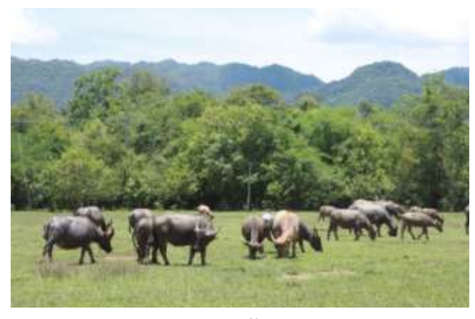
Figure 7: Cows and water buffalos in Kongphat Village

The village headman in Sopkhom Village has 1.5 ha of rice paddy (enough to feed eleven family members), 0.6 ha of riverbank gardens where he grows chili, and eleven cows grazing in the village. In his riverbank garden, he harvests 1.2 tons of chilies a year, which he can sell for 10,000 kip per kilogram to the market in Lak Sao. He is going to lose all his land due to the project; however, he is having difficulties finding replacement land near the resettlement site where he is supposed to move sometime between 2009 and 2011.