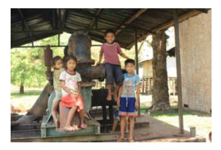
Figure 2: Children playing with an abandoned irrigation pump in Kongphat Village

Fluctuating water levels and stronger flows have caused erosion along the Hai and Hinboun rivers leading to the loss of fertile agricultural land, fruit trees, riverbank gardens and vegetation. Resource Management and