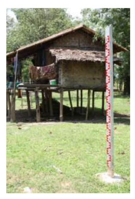
Figure 5: A water gauge set up in Xang Village

Regarding the cost for resettlement entitlements and relocation of affected people, the Decree requires that "Project owners shall prepare the Resettlement Plan with detailed cost estimates for compensation and other resettlement entitlements and relocation of APs" (Article 14, paragraph 1). However, the final Resettlement Action Plan does not include costs for resettlement in the downstream areas. It only includes a budget for infrastructure development and livelihood improvement (THPC 2008, Part3: 71-72).