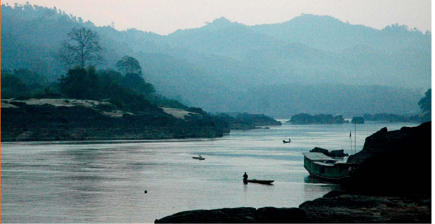
The Mekong River, downstream of the proposed site for the Xayaburi Dam