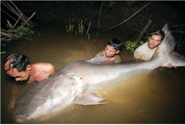
The Xayaburi Dam will threaten the last remaining population of the critically endangered Mekong Giant Catfish.

in the MRC's SEA report, a group of globally renowned fisheries experts have unequivocally stated that fish ladders will not work due to the Mekong River's large biodiversity and its high number of fish. Even if the fish passages are designed for a few specific species, the SEA report warns that the Xayaburi Dam's height of 32 meters is higher than the maximum height at which fish ladders will work.