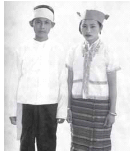
The Yintalai: A Tribe Threatened with Extinction.

The Salween River basin consists of not only rich biodiversity, but also rich ethnic, cultural and linguistic diversity. The different ethnic minority groups residing in the basin rely mostly on lowland rice paddy farming and upland swidden cultivation and harvesting of non-timber forest products, a lifestyle enabling them to co-exist with the forest for generations. However, often the local people are not able to engage in stable agriculture because of the decades-long civil war for self-determination and the struggle for democratic rule. Areas that are used for seasonal cultivation of crops, as well as important archaeological and cultural sites will be lost. The Salween Dams will completely submerge all of the sacred land, cultural heritage, livelihood, homes, and forests of the Yintalai, a tribe with only approximately 1,000 people remaining in the world.