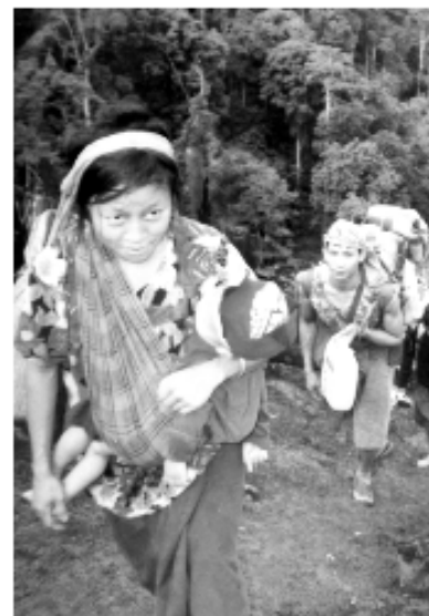
Internally Displaced Villagers fleeing in the Burmese jungle

The first dam in a series of five dams is the 600 - 1,200 megawatt Hutgyi Dam in Karen State, where the largest and most sustained military offensive by the Burma's army in many years is currently underway. This new offensive, being executed as the most significant agreements between the countries and the respective companies have been finalized and signed, has resulted in an alleged 15,000 newly displaced people in the past 8 months, some 3,000 of whom were new would-be-refugees at the border. Landmines have been strewn throughout the area, one of which killed an EGAT worker involved in the feasibility study survey. Following his death, EGAT and the EIA consultant team withdrew from the site. Despite having incomplete data to properly finalize the EIA, EGAT plans to continue to the next stage of dam construction.