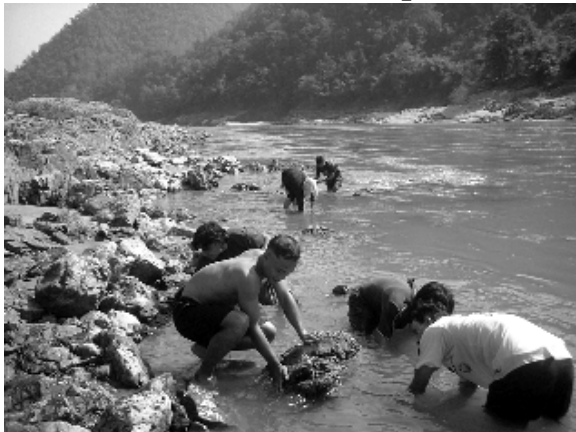
Villagers collecting food from the Salween River

Where the Salween runs through Burma and along the Thai-Burmese border, at least thirteen ethnic groups, including the Shan, Karen, Karenni, Mon, Wa, Pa-O, Lahu, Padaung, Akha, Lisu and Palaung, live in traditional communities along its banks. Under the current Burmese military regime, there will not be any form of public participation regarding the dams, and the communities who will be forced to bear all of the negative impacts from dam construction will not see any benefits. It has been well documented that infrastructure development in Burma involves the use of forced labor. In addition, the military forces villagers to relocate without providing compensation.