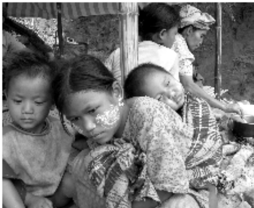
Children forced to flee from the Burma Army