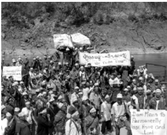
Villagers protesting the Salween Dams in Burma

Despite the high risk of operating in a war zone in what Transparency International rates as one of the world’s five most corrupt countries, the Salween dams would be by far the biggest ever investment in Burma at US $10 billion, with unexpected costs and delays easily doubling the costs. Even building the Ta sang dam would pour a minimum of US $7 billion into the country and the contracting companies, revenue that would help keep the regime in power. And although Burma faces a major and prolonged energy crisis, the country and its people would receive little electricity from the Salween dams.