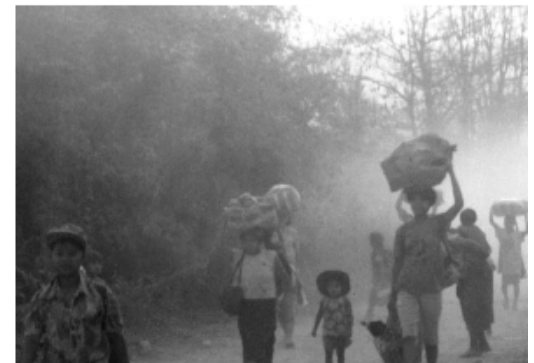
Villagers forced to leave their home due to a development project in Burma

The main stated purpose of the dams is to provide large amounts of “cheap” electricity to Thailand and “much needed foreign exchange” to the Burmese military regime. Thailand has experienced strong civil society resistance to building dams and coal-fired power plants in their own country. Thai officials have therefore worked to negotiate deals to import hydro-electricity from dams built in neighboring countries with authoritarian regimes where citizens cannot question government-backed projects without justifiable fear of reprisals.