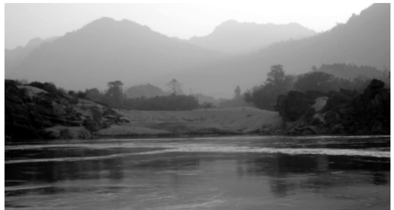
Salween River in Burma

The environmental consequences of the proposed dam projects will be vast and irreversible. The Salween River, known as the Nu River in China and the Thanlwin River in Burma, remains the longest river in all of mainland Southeast Asia that flows freely, uninterrupted by massive dams. The Salween/Nu River basin has been designated as the Three Parallel Rivers UNESCO World Heritage Site in Yunnan, China for its extremely rich biodiversity, rare wildlife and internationally recognized wetlands. Over one hundred species of fish, migrate up the Nu/Salween River and its tributaries. There are many rare and endemic plants, animals, and fish species, and the teak forests lining the river are some of the most fertile in the world. In addition to flooding villages and agricultural fields, the planned Salween Dams would flood several protected areas, including the Salween Wildlife Sanctuary.