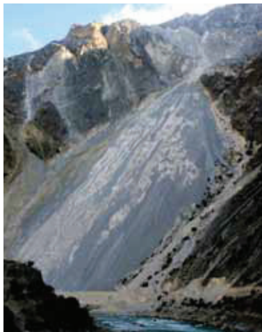
Construction of dams and related activities could aggravate geologic hazards.

with reporting requirements under China's new environmental laws. However, in 2011, officials revealed plans to resume the dams as part of China's 12th Five-Year Plan.