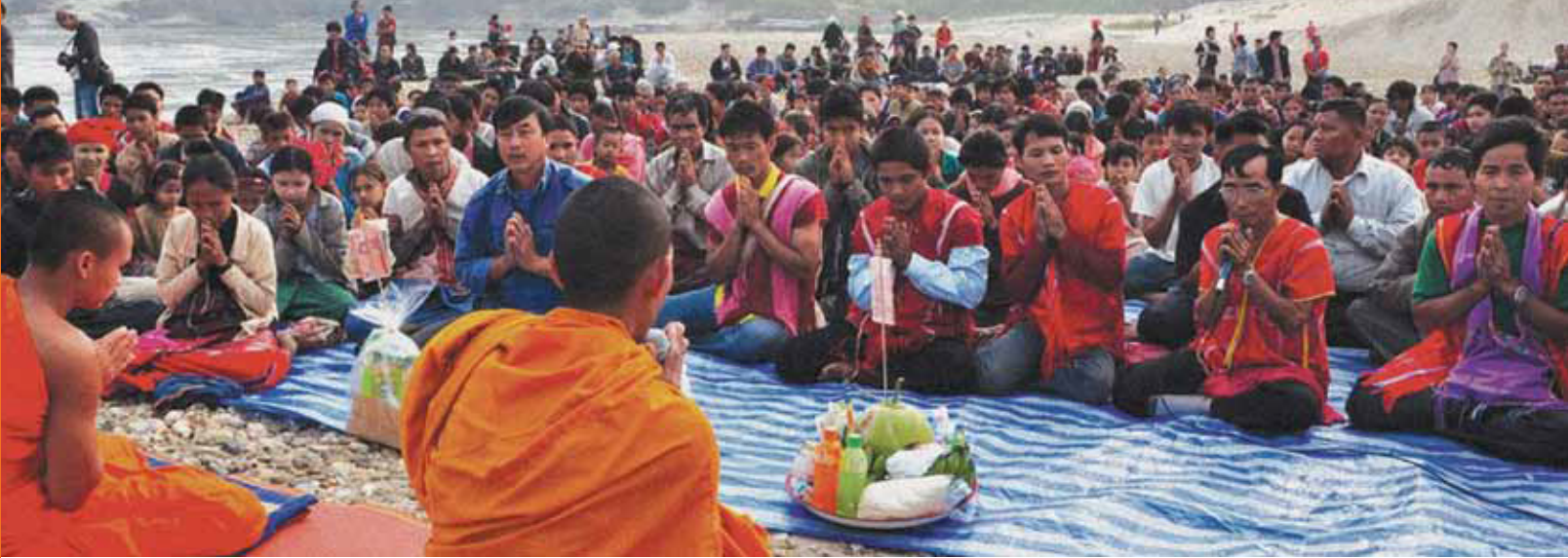
Villagers at the Thai/Burma border gather to bless the Salween River and oppose construction of large dams.