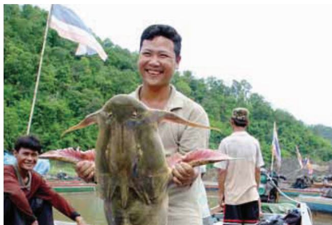
A Thai-Karen fisherman showing off his catch.

The proposed dams in Burma are located in active civil war zones, which is partly why they have proven problematic to develop. Since project preparations began, there has been increased militarization at the dam sites, which has been linked to the escalating abuse of local populations. According to Human Rights Watch, Shan Women's Action Network and other relief groups, members of ethnic