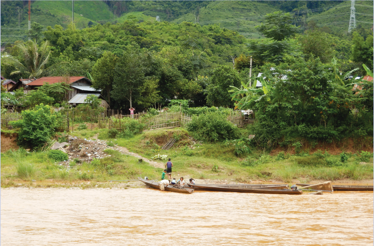
People living along the Nam Ngiep depend upon the river for sustenance and transportation.