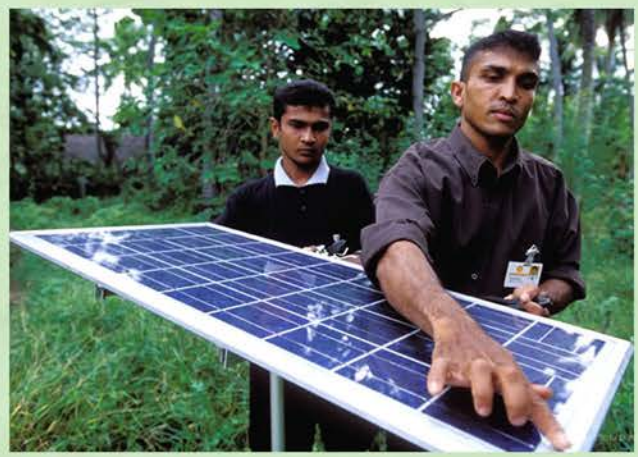
RERED Program, Sri Lanka

We should be investing in clean energy if we want to combat global climate change.