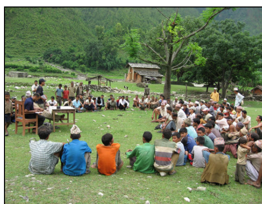
Meetings with affected people