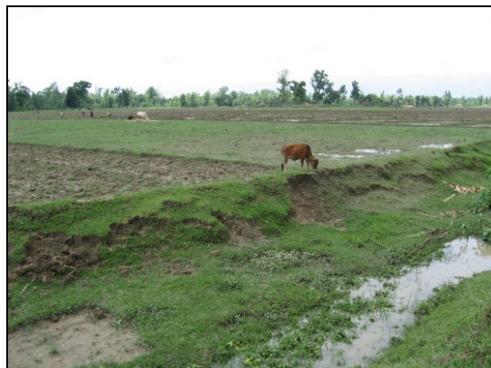
Submerged area (left) and resettlement area (right)