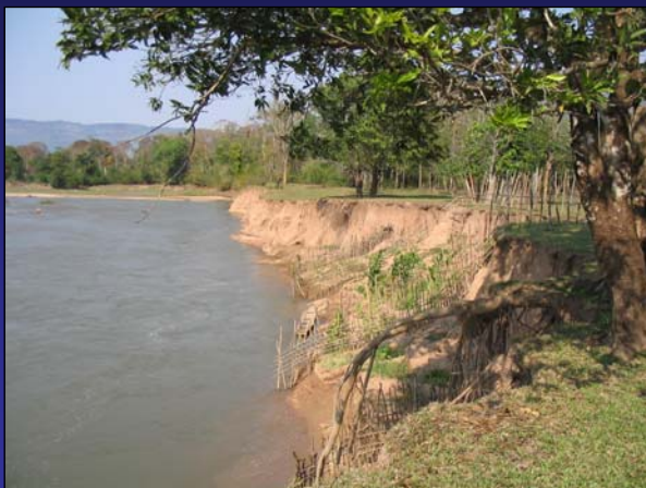
Soil erosion downstream of the Theun Hinboun hydropower project