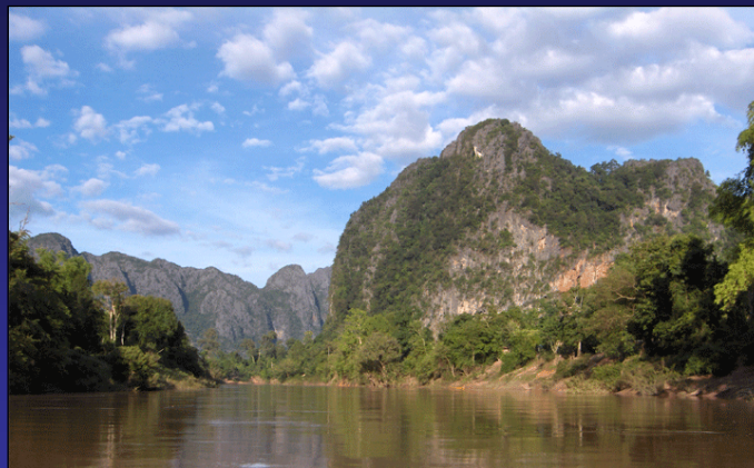
Carl Middleton International Rivers Network