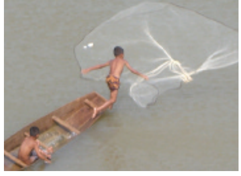
freshwater fisheries for food and income.

Those forced onto resettlement sites often do not have clean water to drink or enough food to eat. They languish there, stripped of their traditional livelihoods, land and natural resources - the social fabric that binds their communities together ripped apart. Alcoholism, depression, domestic violence and disease increase.