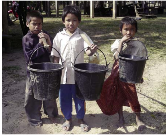
Children collecting water from the Xe Bang Fai

Roughly 6,200 indigenous people living on the Nakai Plateau have been moved to make way for the Nam Theun 2 dam and its reservoir. While resettled villagers have received better houses, water supply, and electricity, it is unclear how they will feed their families and earn income in their new sites. Villagers were given small plots of poor quality land that has not yet been irrigated. They will be forced to grow mainly vegetables to sell in an as yet unidentified market. They were originally guaranteed 10,000 hectares of production forest, but the area has since been reduced by at least 40 percent and is further threatened by illegal logging. Villagers were promised bountiful fish in the new reservoir, but the company has cleared only a minimal amount of vegetation from the area. This rotting vegetation will cause water quality problems and kill fish.