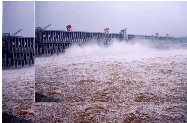
Water discharged into the river below the Three Gorges dam

But by speeding up the timetable, the buildup of silt in the reservoir will also occur earlier than originally forecast. Sedimentation-modelling experiments that were done for the Three Gorges project feasibility study forecast that silt accumulation in the reservoir would pose a threat to the port of Chongqing after the dam had been in operation for 20 years. For this reason, the municipality is building a US$175-million port at Cuntan, 40 kilometres downstream of central Chongqing. The new port, scheduled for completion in 2010, is designed to replace Jiulongpo in downtown Chongqing, the largest port in the upper reaches of the Yangtze.