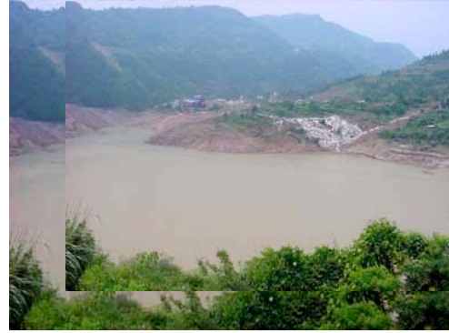
Qinggan River blocked after the July 13, 2003, landslide

Several hours later [at 00:20 on July 13, 2003], a huge block of the mountain, 24 million cubic metres in volume, slid into the Qinggan River, completely blocking the 100-metre-wide river. The landslide's crash into the river also created 20-metre-high waves that capsized 22 boats. Within minutes, four factories, 300 homes and more than 1,000 mu [67 hectares] of farmland were destroyed. According to the official count, 14 people were killed and another 10 listed as missing.