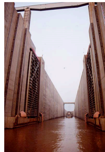
A chamber of the five-step shiplock