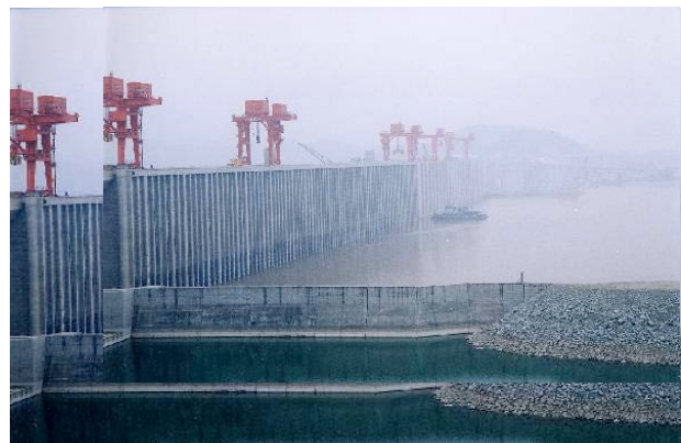
Still water in the reservoir behind the dam

Metropolitan Chongqing now has the capacity to treat 60 per cent of its wastewater, while this same capacity is now at 67 per cent in the rest of the reservoir region.