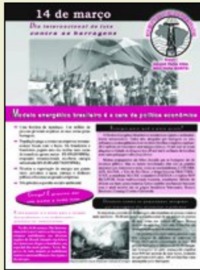
Brazil's Movement of Dam-Affected People (MAB) Event Poster