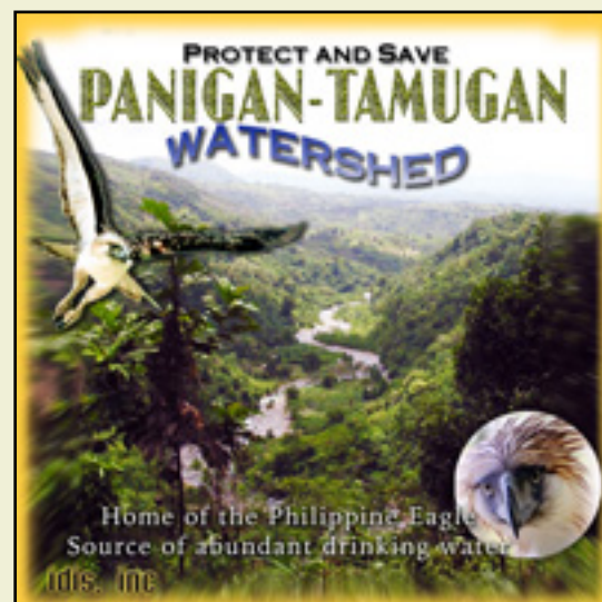
Interface Development Initiatives (IDIS) Promotional Poster