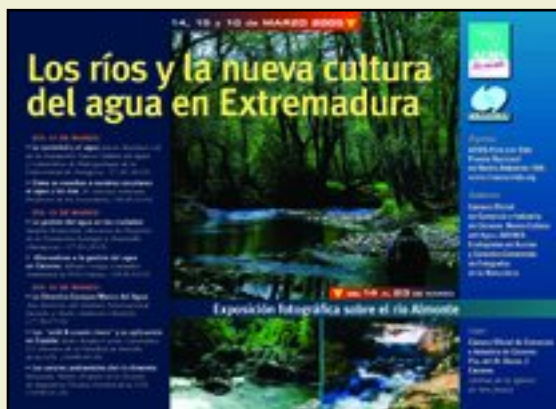
AEMS - Ríos con Vida Event Poster

PowerPoint presentations require Microsoft PowerPoint to be viewed