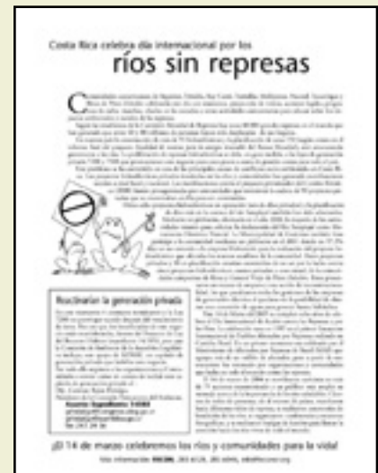
The Costa Rican Federation for Environmental Conservation Event Poster