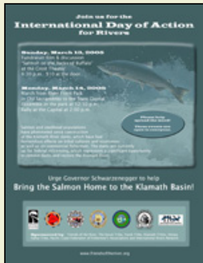
Friends of the River, Sacramento, CA, USA Event Poster